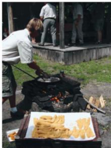
Two faces of dining: five-star and shore lunch

its pickerel (which is impossible not to catch), northern pike, and the ultimate prize, muskie.